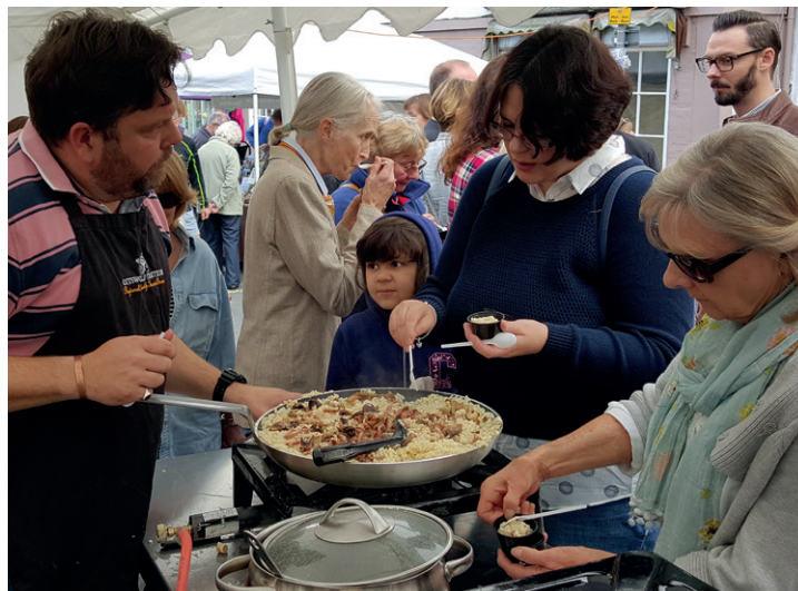
Cookery demonstrations, talks and live music kept visitors entertained

Music was provided by popular local duo, The Peas, while the Cotswold Distillery gave a mixology demonstration, offering plenty of ideas for gin cocktails.